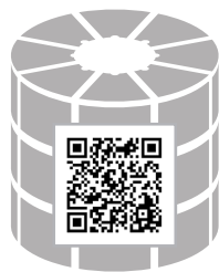
eCrimp™ Mobile App

Gates exclusive database containing the most up-to-date specifications for Gates hydraulic and industrial hose products including crimping instructions, crimp diameter and maintenance/troubleshooting information. Gates “Smart Crimpers” internally source eCrimp™ - with continuous updates via WiFi - for the most current product and crimp data available.