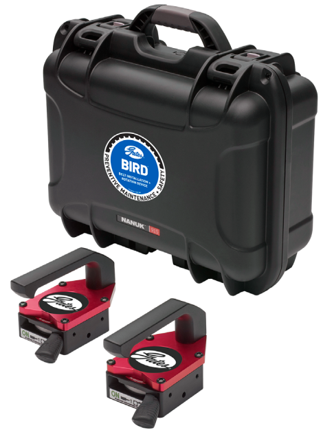
PRODUCT # 7420-1001